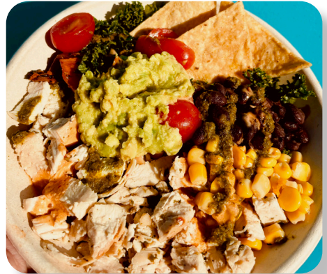
Use up common pantry ingredients!