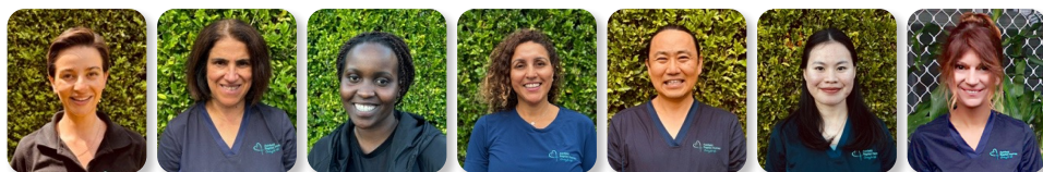
Your Bethel Home Care Support Workers

Not feeling quite like your usual happy yourself? Feeling down or lonely? Please don't suffer in silence. Your Bethel Home Care Team is here to help.