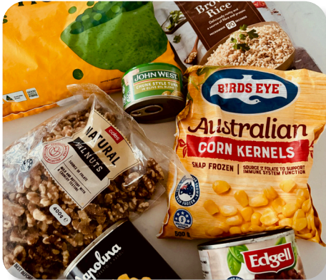
Then add some chopped fresh ingredients.

According to the CSIRO modestly higher protein diets are important for older adults and can help slow down loss of muscle mass. According to Professor Brand-Miller, adults over 60 should be aiming to consume around 90g of protein per day. So make sure you add some high protein ingredients such as beans, lentils, nuts lean meat, fish, or cheese to your bowl.*