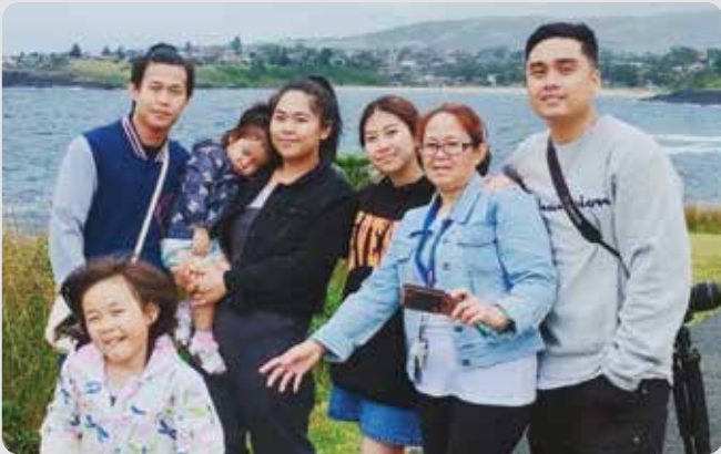
Above: Family walk.

spending quality time with my family is something I love to do, especially cooking meals for them based on their requests. I also find joy in knitting and creating scarves.