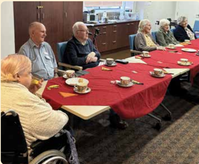
Top: ABH Reconciliation Family Tree; Above: Reconciliation afternoon tea.