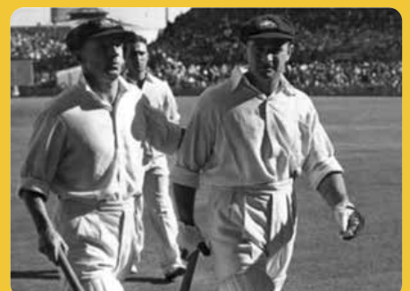
Top: Les's reading corner. Bottom: Bradman and Barnes, SCG 1946.