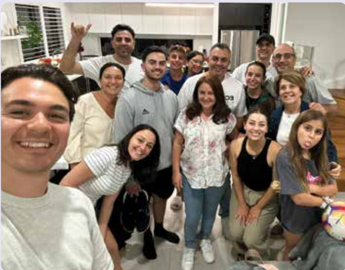
All the family.