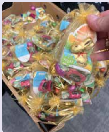
Celebrating Easter deliveries