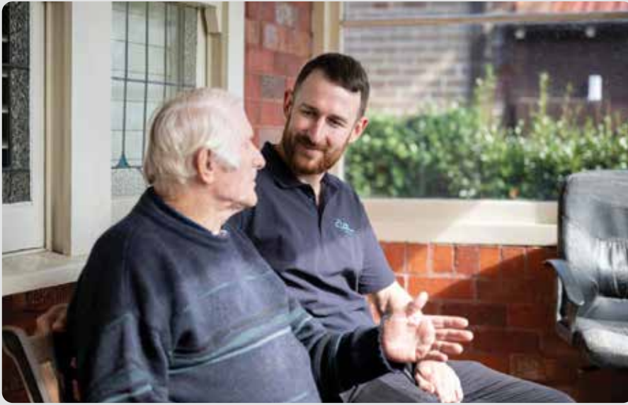
Above: Chatting with a home care client

I love Kookaburras and gained the trust of a wild one, who comes inside and hangs out with me. I named him Kevin and his favourite treat is raw chicken.