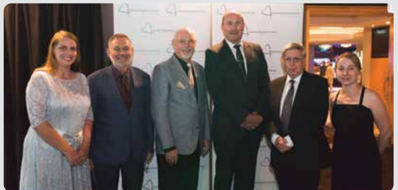
From left to right: 1946, at home; 1971, getting engaged; 2018, The ABH Board at the AH Orr 40th Anniversary.