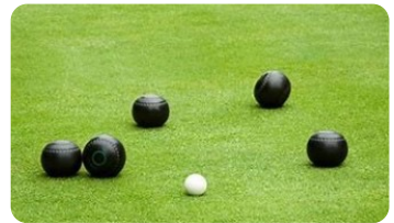
Meet Jack - the little white ball!