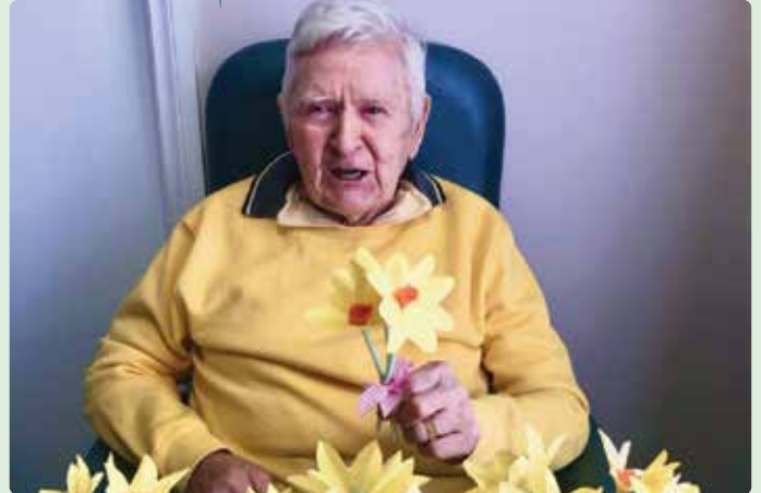
Left: Off to New Zealand. Right: On Daffodil Day.

I reached A grade and brought home a lot of chooks as prizes. Getting a hole in one was a high point and the golf ball company sent me a letter of congratulations.