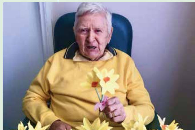
Left: Off to New Zealand. Right: On Daffodil Day.

I reached A grade and brought home a lot of chooks as prizes. Getting a hole in one was a high point and the golf ball company sent me a letter of congratulations.