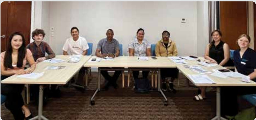
New staff orientation session, Jan 2024.