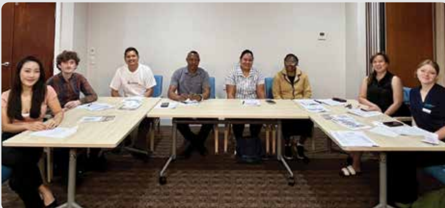
New staff orientation session, Jan 2024.